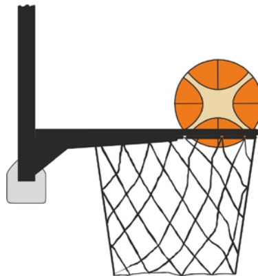
Diagram 4 Ball is within the basket

31-24 Statement: It is an interference violation if a defensive player touches the ball while the ball is within the basket.