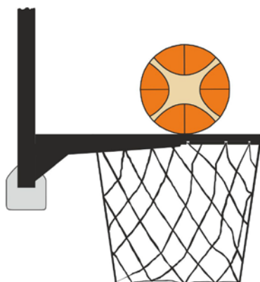
Diagram 3 Ball in contact with the ring

31-19 Statement: An interference violation is committed by a defensive or offensive player during a shot for a field goal when a player touches the basket (ring or net) or the backboard while the ball is in contact with the ring and still has a chance to enter the basket.