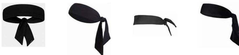
Diagram 1 Examples of scarf-style headbands

4-4 Statement: Wearing of scarf-style headbands is not permitted.