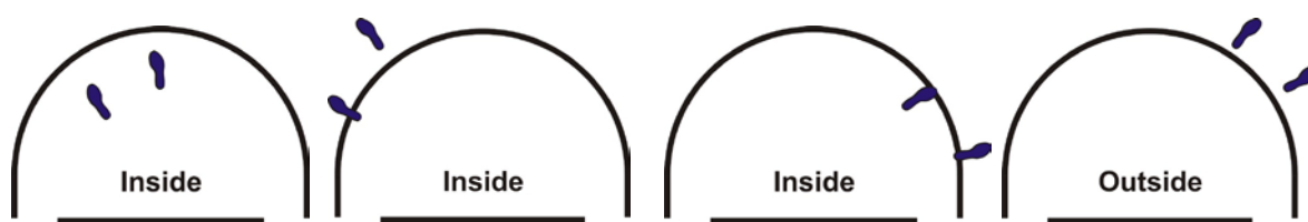
Diagram 5 Position of a player inside/outside the no-charge semi-circle area

33-4 Example: A1 attempts a jump shot that begins from outside the semi-circle area. A1 charges into B1 who is in contact with the semi-circle area.