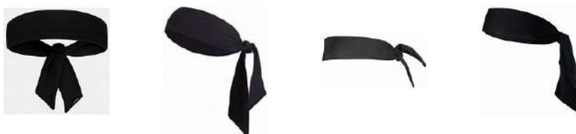
Diagram 1 Examples of scarf-style headbands

4-4 Statement: Wearing of scarf-style headbands is not permitted.