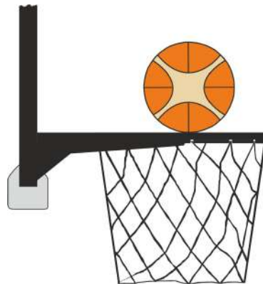
Diagram 3 Ball is in contact with the ring

31-19 Statement: An interference violation is committed by a defensive or offensive player during a shot for a field goal when a player touches the basket (ring or net) or the backboard while the ball is in contact with the ring and still has a chance to enter the basket.