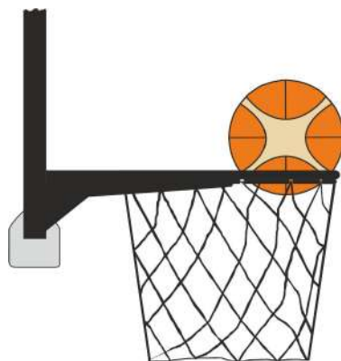
Diagram 4 Ball is within the basket